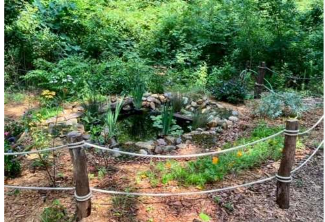
Above are photos of the Dragonfly Pond at Belville Riverwalk Park