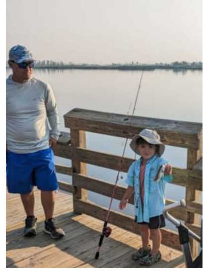
Above are photos from the Third Annual Youth Fishing Day