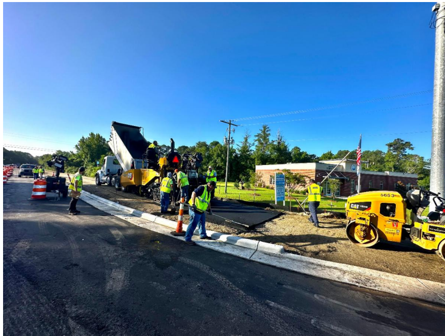
A photo of the progress being made on the the multiuse path component of the River Road Improvement project