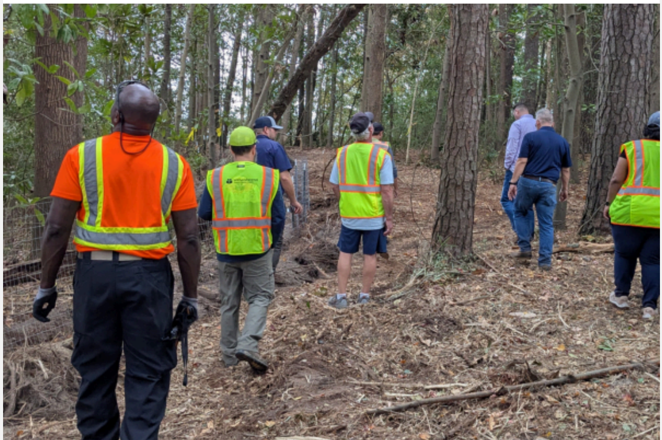
Town staff and leaders review progress on the new and extended walking trails at Belville Riverwalk Park.