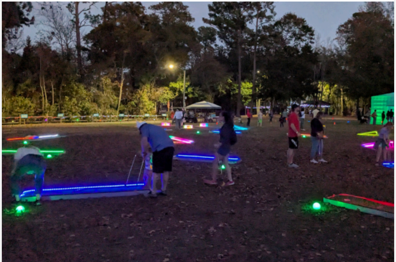
Glow Night Mini Golf sponsored by The Golf Barn was a highlight of November's events at the Belville Riverwalk Park.