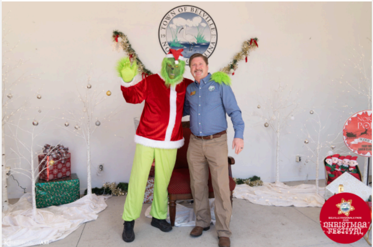
Mayor Pro Tem pauses to take a photo with The Grinch after welcoming the crowd to the annual Belville Riverwalk Christmas Festival.