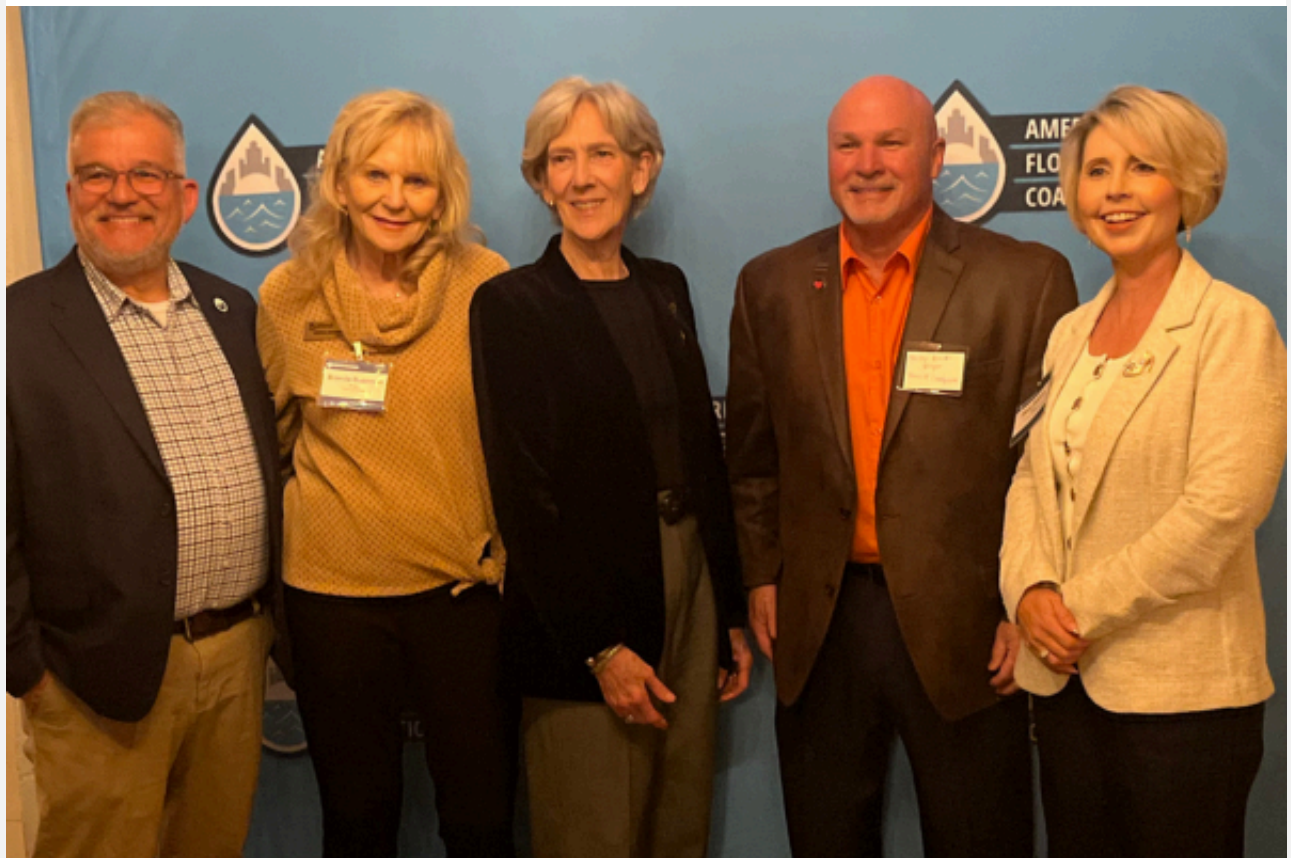
Mayor Chuck Bost poses with other NC Mayors and officials at the American Flood Coalition NC Leaders in Resilience Reception in November.