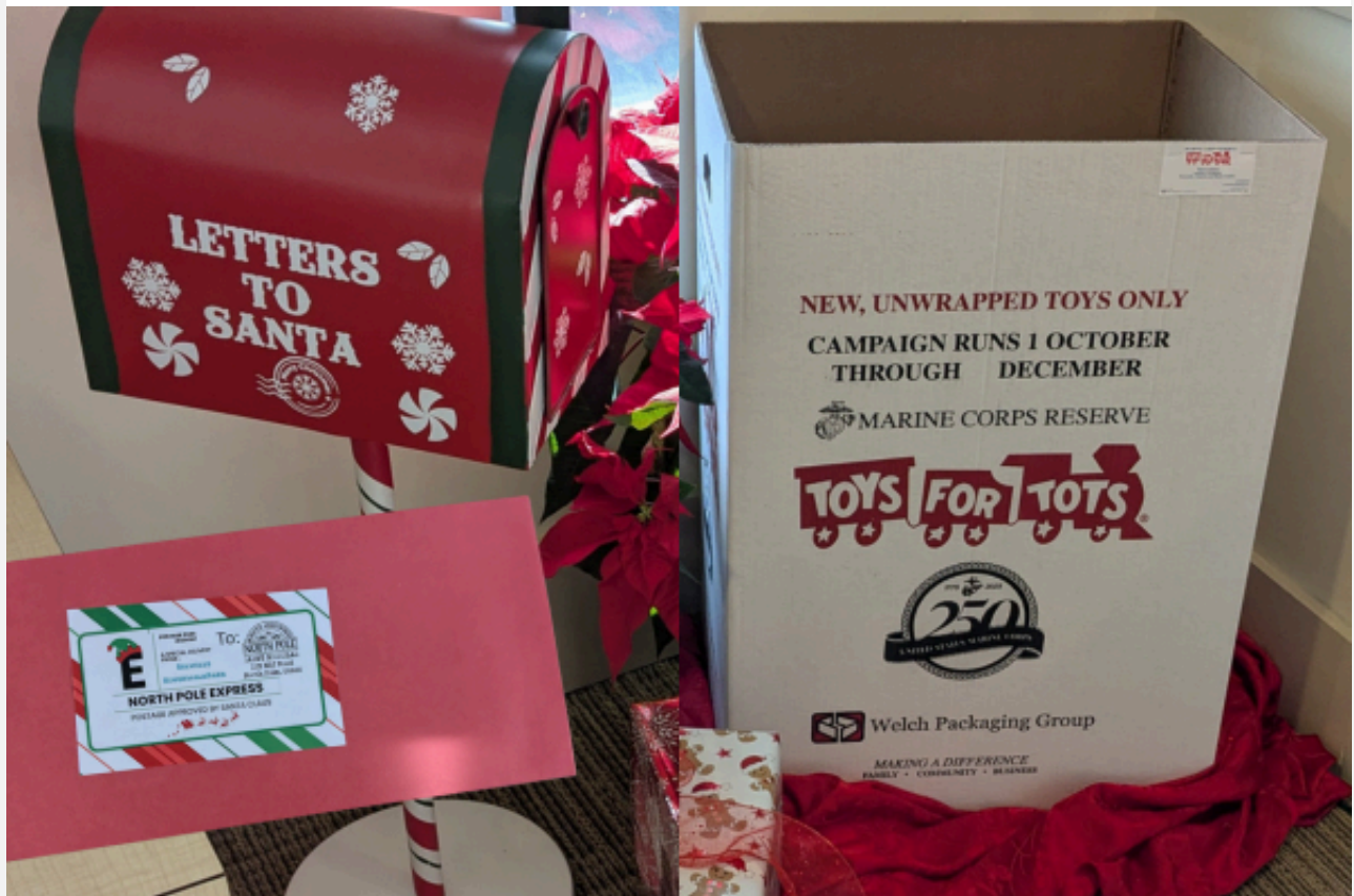
During the month of December Town Hall hosted a Toys for Tots drop off as well as an opportunity for kids of all ages to send a letter to Santa.