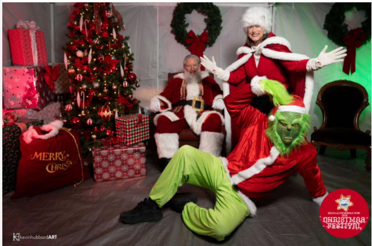
The Grinch also joined Santa for a photo at the annual Christmas Festival at the Belville Riverwalk Park.