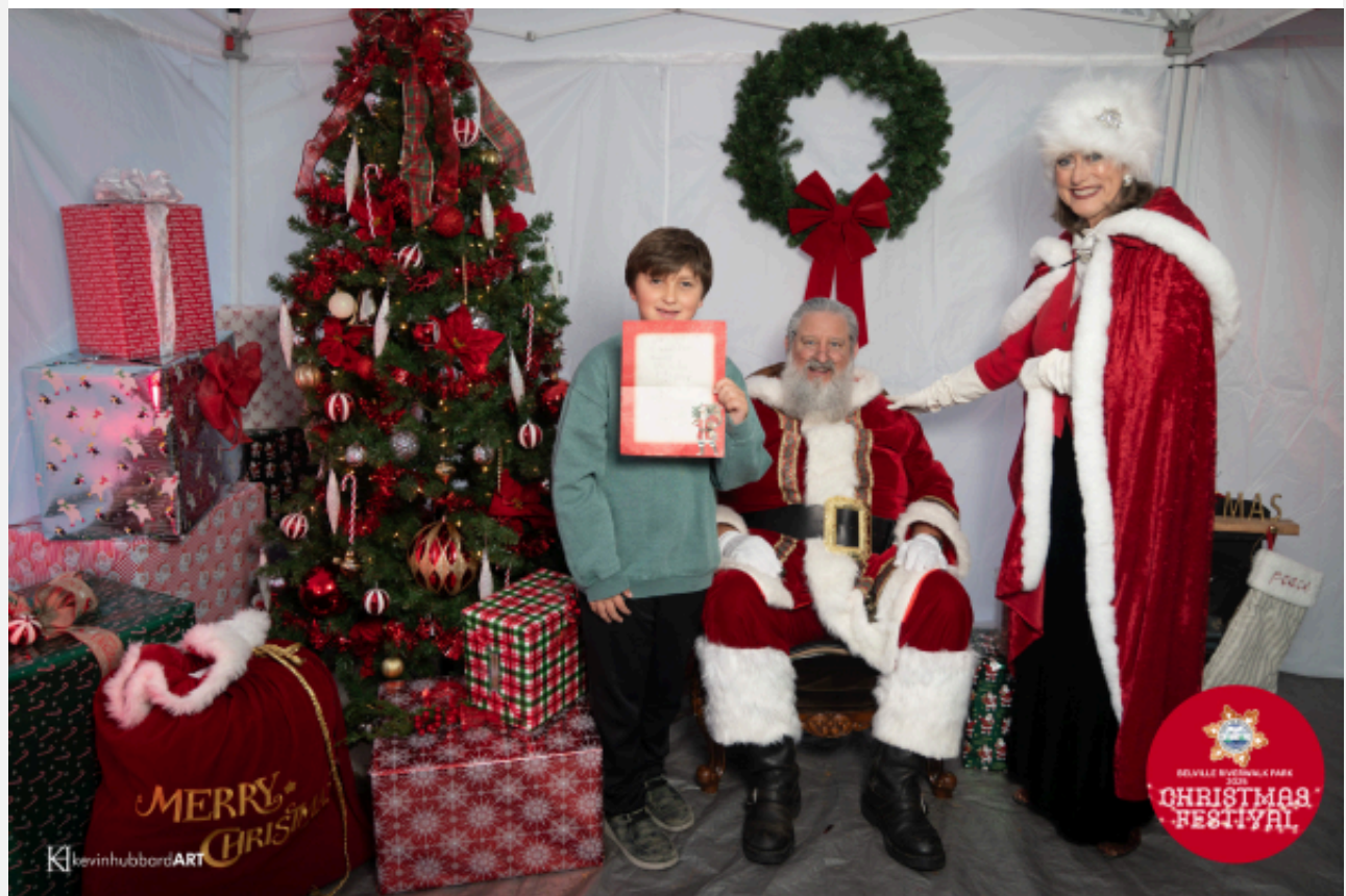
Santa and Mrs. Claus greeted children at the annual Belville Riverwalk Christmas Festival. Several enterprising kids brought their wishlist to make sure Santa hadn't forgotten anything.